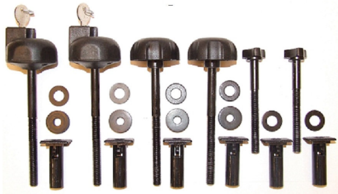
Optional Deluxe (Locking) Half Door Installation Kit*

Note: These instructions apply to both kits. With the Deluxe kit no screw driver is required.