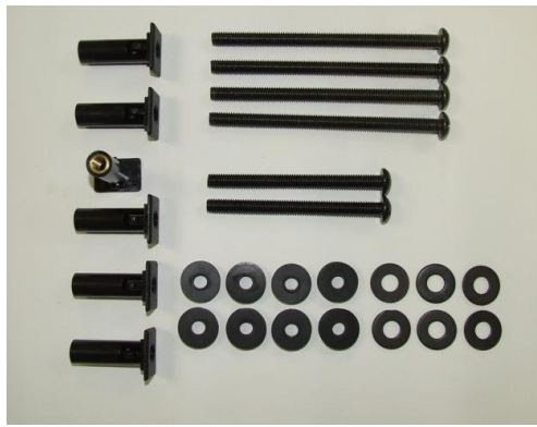
Figure 1 – Standard Installation Kit(TJ or YJ)